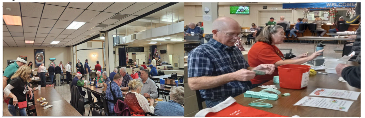
The Tea Dance - no tea and no dancing is looked forward to every year by the Post and Auxiliary members. Gives them a chance to catch with each other and just have an enjoyable afternoon. Snacks are the food of choice today.