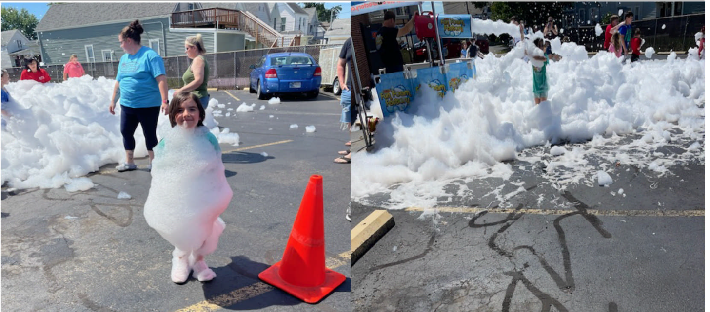
As always, the foam factory is a huge hit - not only with the kids but also the